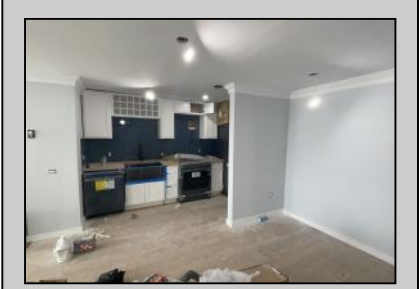
2721 Boardwalk Atlantic City, NJ 08401