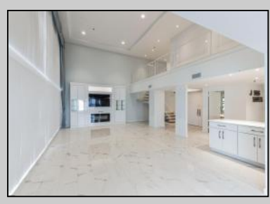
3101 Boardwalk Atlantic City, NJ 08401