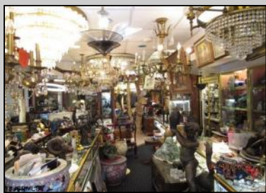
1515 Boardwalk Atlantic City, NJ 08401