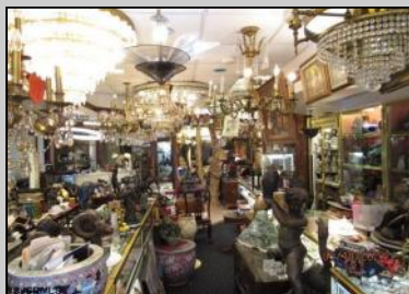
1515 Boardwalk Atlantic City, NJ 08401