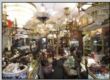
1515 Boardwalk Atlantic City, NJ 08401