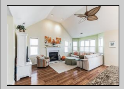
3023 Simpson Ocean City, NJ 08226