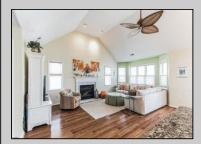
3023 Simpson Ocean City, NJ 08226