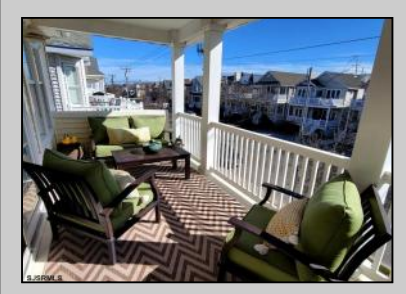
3248 Asbury Ocean City, NJ 08226