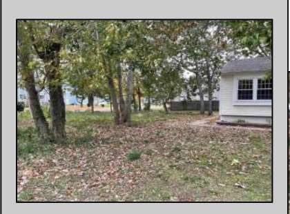
335 1st Somers Point, NJ 08244