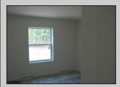
6501 Jersey Ave Egg Harbor Township, NJ 08234