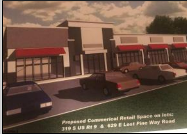
Proposed Commercial Retail Space on lot: 319 S US Rt 9 & 629 E Lost Pine Way Road

319 NEW YORK ROAD Galloway Township, NJ 08205