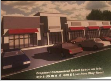
Proposed Commercial Retail Space on lot: 319 S US Rt 9 & 629 E Lost Pine Way Road

319 NEW YORK ROAD Galloway Township, NJ 08205