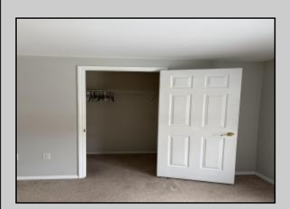
198 Pebble Beach Mays Landing, NJ 08234