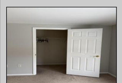
198 Pebble Beach Mays Landing, NJ 08234