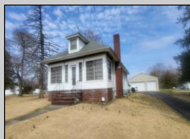
1924 Main Millville, NJ 08332