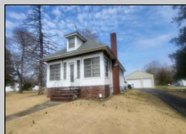
1924 Main Millville, NJ 08332