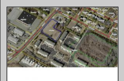
4002 Rte 9 Rio Grande, NJ 08242