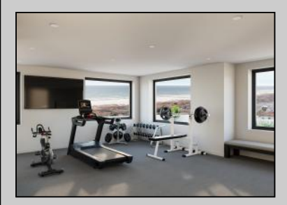
5499 Dune Avalon, NJ 08202