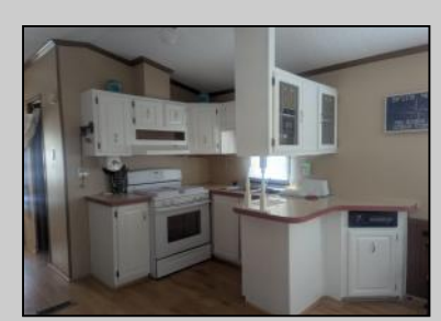
42 West Jersey South Seaville, NJ 08246