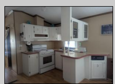
42 West Jersey South Seaville, NJ 08246