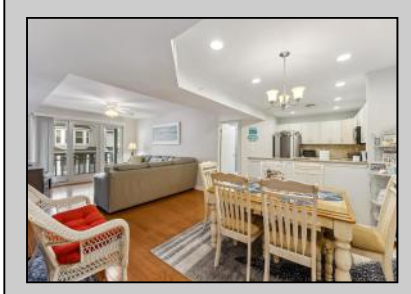
9904 Seapointe Lower Township, NJ 08260