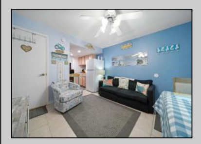
8401 Atlantic Wildwood Crest, NJ 08260