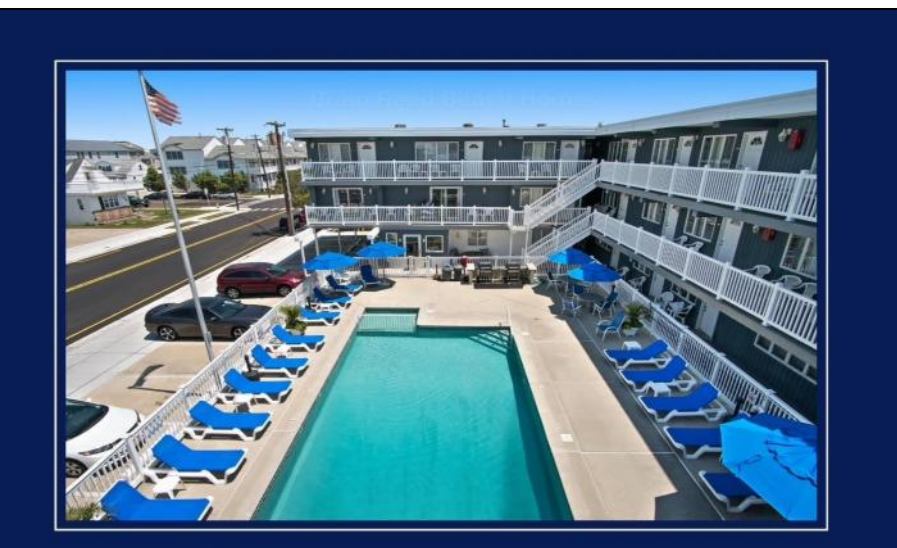
1309 Ocean Avenue #126 Beachblock 2 Bedroom Condo