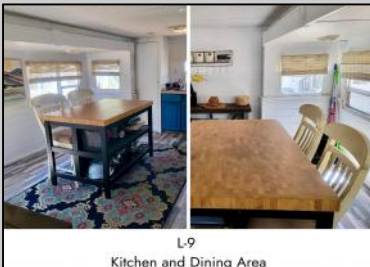
L-9 Kitchen and Dining Area