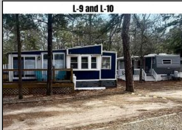
L-9 and L-10