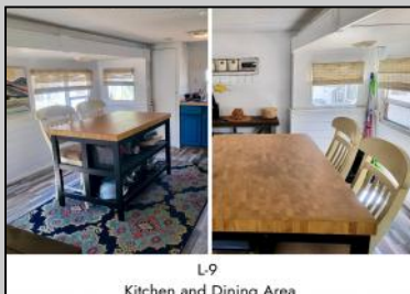
L-9 Kitchen and Dining Area