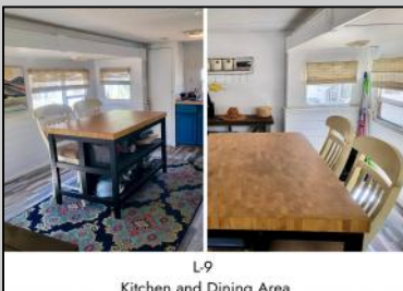
L-9 Kitchen and Dining Area