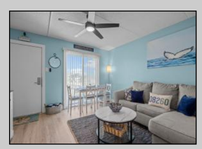
301-309 Ocean North Wildwood, NJ 08260