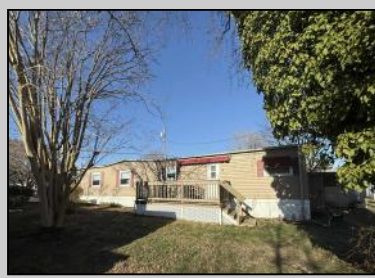
169 Stimpson West Cape May, NJ 08204