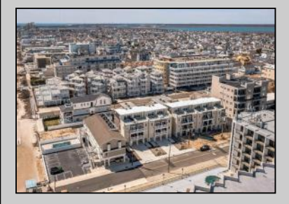
418-420 Farragut Wildwood Crest, NJ 08260