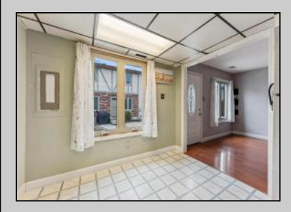
3311 Bayshore North Cape May, NJ 08204