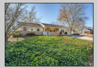
202 Pacific Palermo, NJ 08223