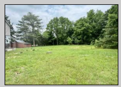
1522 Route 47 Woodbine, NJ 08270