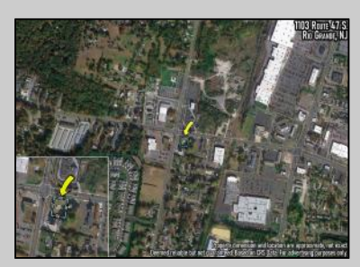
1103 Route 47 Rio Grande, NJ 08242