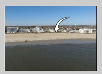
610 Beach Cape May, NJ 08204