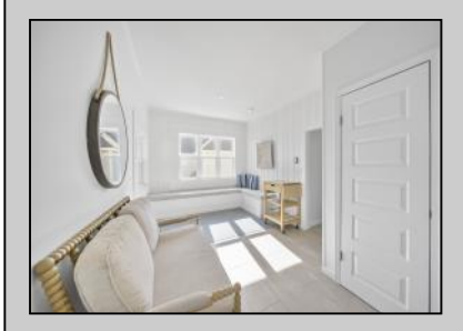
8300 Second Stone Harbor, NJ 08247