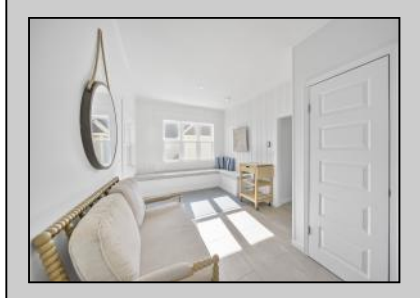
8300 Second Stone Harbor, NJ 08247