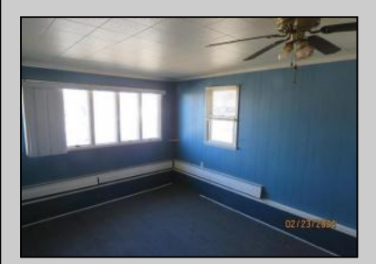
802 Burton Northfield, NJ 08225