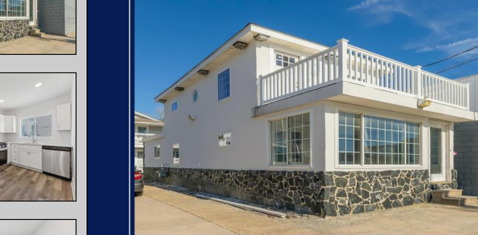
123 E Lincoln Avenue Wildwood, NJ 3 Bedroom 2 Bath Single Family