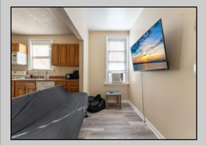
107 Magnolia Wildwood, NJ 08260