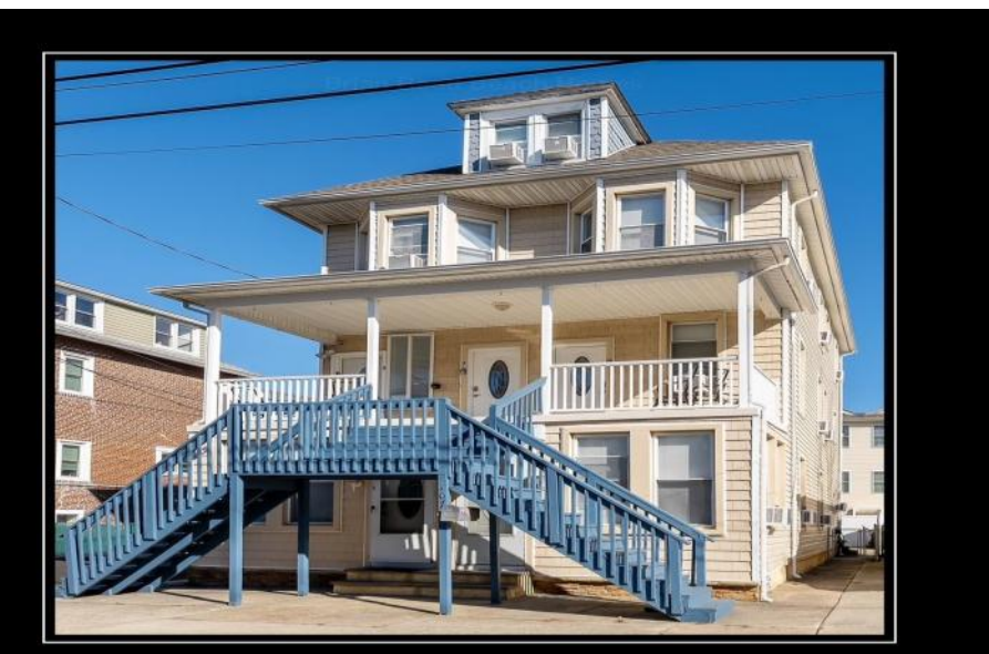
107 E Magnolia Wildwood NJ 6 Bedroom Townhouse