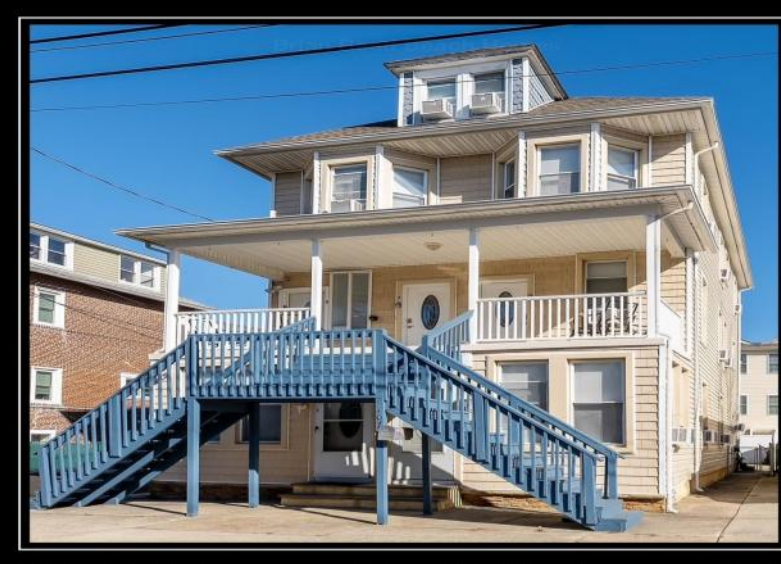
107 E Magnolia Wildwood NJ 6 Bedroom Townhouse