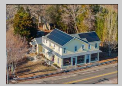
742 Seashore Cold Spring, NJ 08204