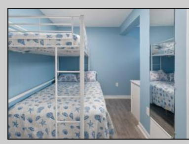
1504 Atlantic North Wildwood, NJ 08260