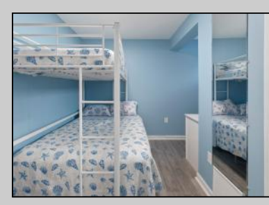
1504 Atlantic North Wildwood, NJ 08260