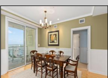
9601 Atlantic Lower Township, NJ 08260