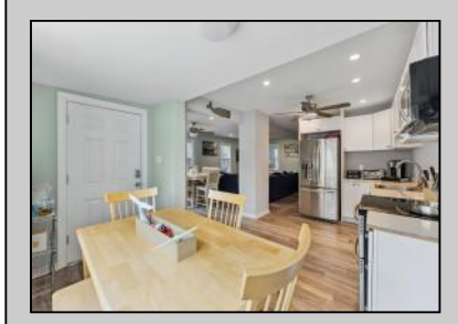
3007 Pacific Wildwood, NJ 08260