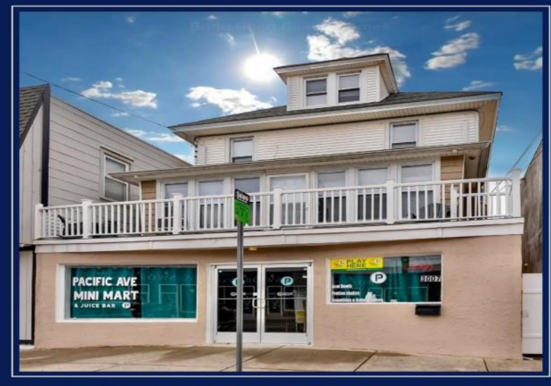
4 BEDROOM TOWNHOUSE AND STOREFRONT 3007 Pacific Avenue Wildwood, NJ