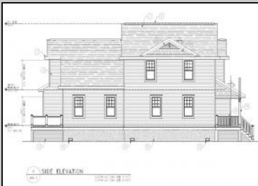
SIDE ELEVATION A4.3