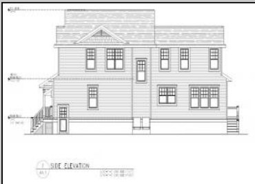
SIDE ELEVATION A4.2