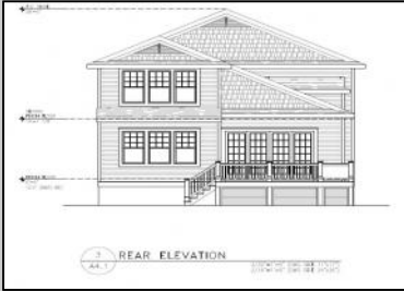
REAR ELEVATION A4.1