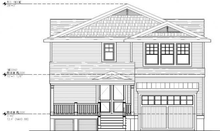
1 FRONT ELEVATION A4.1 3/32"=1'-0" (DWG S/E 11"x17") 3/16"=1'-0" (DWG S/E 24"x36")