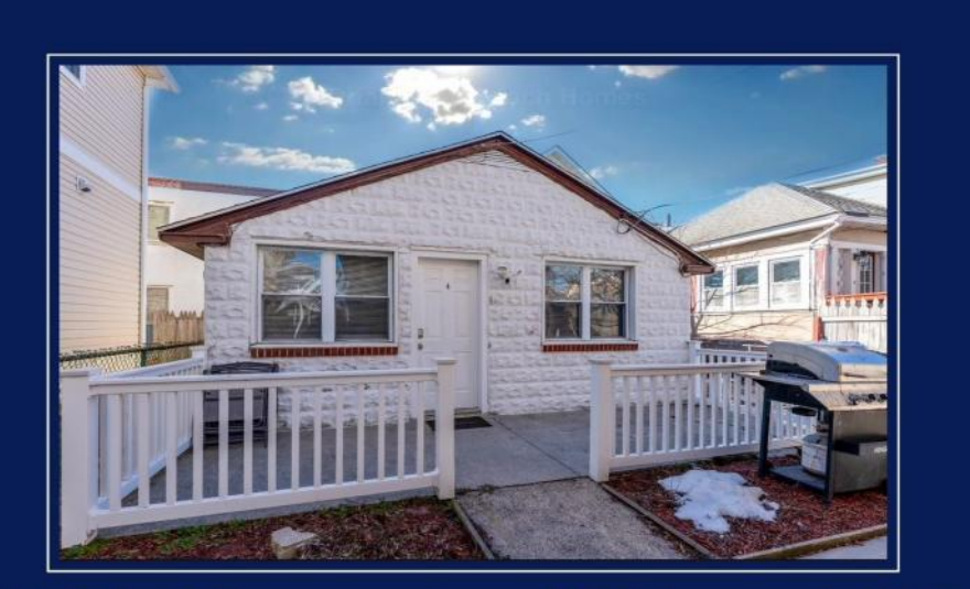
138 E Youngs Ave Wildwood, NJ Rear Cottage